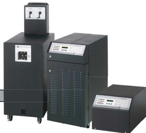
Heritage Family of Products