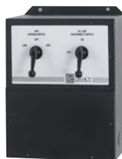
Maintenance Bypass Switch